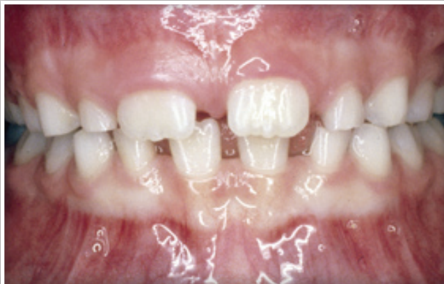
EXCESS SPACES BETWEEN FRONT ERUPTING PERMANENT TEETH

Consult your dental professional for advice if you become aware of any of the following problems in your child's mouth: excessive spacing, misshaped teeth, missing teeth, poorly erupting adult teeth and rotated or crowded teeth. These problems may be helped with the use of the Nite-Guide® and/or the Occlus-o-Guide® appliance. 8,20,21,28