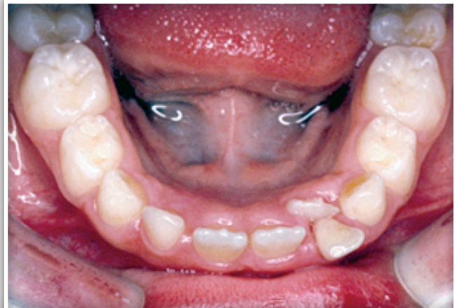
ROTATED OR CROWDED TEETH