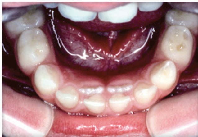
POORLY ERUPTING ADULT TEETH