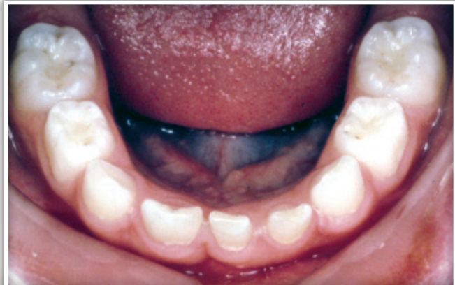
DOUBLE-SIZED BABY TOOTH AND MISSING BABY TOOTH